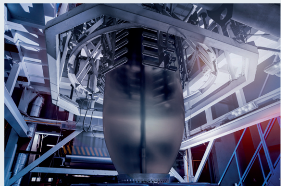
Frequent bubble collapse is a constant hassle when working with PCR. This can be significantly reduced with BAEROPOL T-Blend.