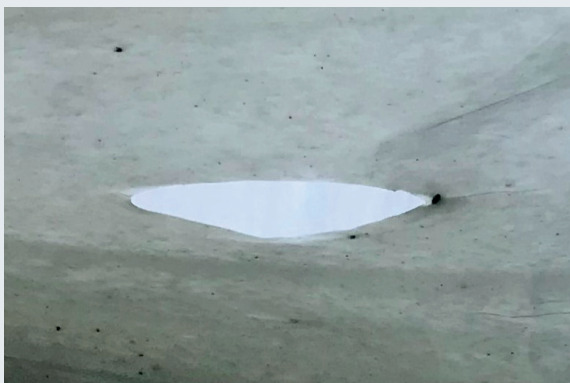
Pin-holes are a major contributor to high scrap rates and, if left unresolved, something that can result in customer claims.

BAEROPOL T-Blend is intended to be added directly during film recycling, either in an in-house recycling line or by dedicated recyclers. Most film recycling lines are equipped for convenient addition of BAEROPOL T-Blend. If not, they can easily be retrofitted with a simple dosing system.